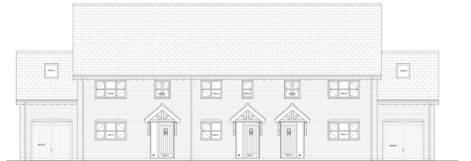
Plots 24, 25 and 26 Proposed South (Front) Elevation